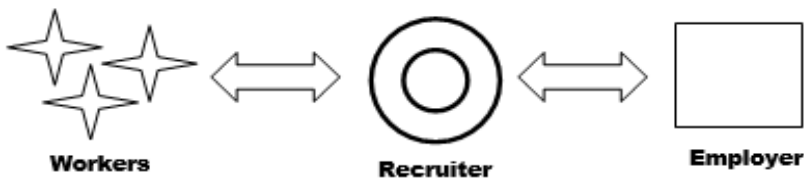
Figure 1: The Basic Recruiter-Employer Relationship

Although the core action of recruitment is captured in this simple diagram, the process of delivering people in one country to work in another often involves a chain of subcontracting arrangements. 125 As shown in Figure 2, a principal recruitment firm—which may be located in the destination or origin country, or both—may manage a network of sub-agents who stretch its